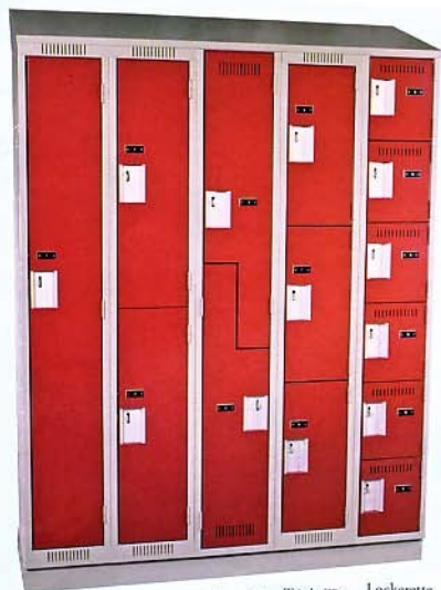
Single Tier Double Tier Portoclub Triple Tier Lockette

Anthony Steel Clean-Line Lockers are the result of over 20 years of manufacturing experience. ASM Clean-Line Lockers are designed to provide strength & durability in even the most demanding environments.